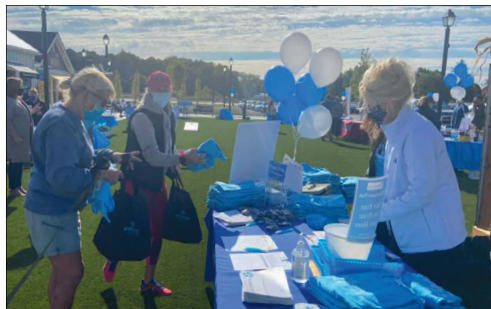
Volunteers and staff welcomed each guest as they arrived to pick up their shirt and 'Care' bag.

Although this event looked very different from prior years, we exceeded our fundraising goal and raised over $42,000 for the Care Fund.