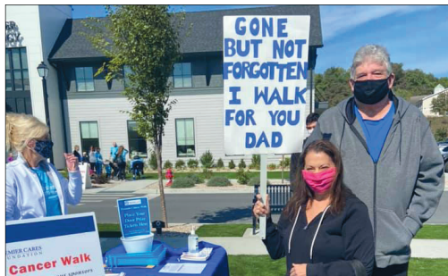
Together, we honored those who lost their battle to prostate cancer and encourage all men to get screened.