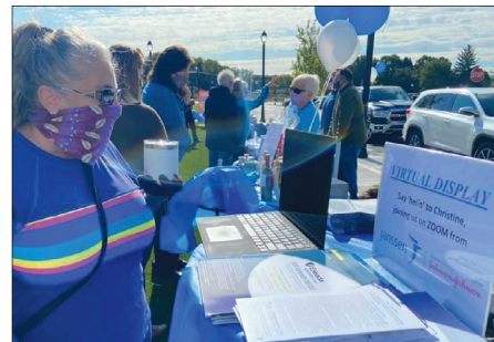
Companies who were not able to attend the event in person, engage with participants via Zoom.